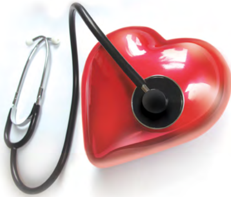
Protect your heart this month [p.4]

Monthly Information and news provided by the Office of Communications and Marketing