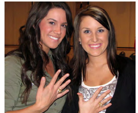
TTUHSC students participate in the institution's first class ring ceremony at the International Cultural Center Hall of Nations.

Since its unveiling, the class ring has been a universal symbol of academic achievement among all Texas Tech campuses. The ring is a tradition that dates back to the 1950s that encompasses the Double T, Masked Rider, the Administration Building Bell Tower and the Texas Tech University Seal. Each