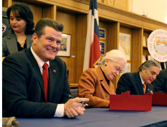
TTUHSC signs agreement with UTEP [p.2]