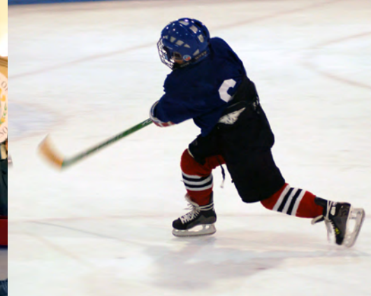
Preparing children for athletics [p.2]