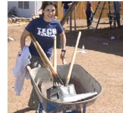
Opportunities for involvement in community projects impacting a wide variety of residents stretching from the South Plains to the Davis Mountains and our bordering country, Mexico