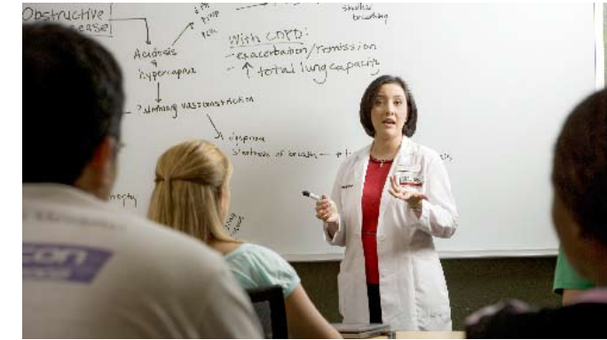
Learning in an innovative, dynamic and caring environment