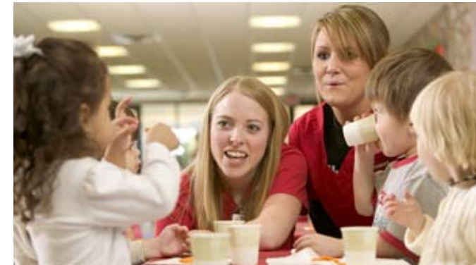
Strong clinical focus; variety of clinical experiences

The primary mission of Texas Tech University Health Sciences Center School of Nursing is to provide quality educational programs. In addition, the school supports excellence in health care for diverse racial, cultural and ethnic populations in West Texas through programs of scholarship, research, practice and service.