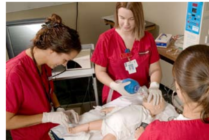
Nationally recognized Clinical Simulation Center