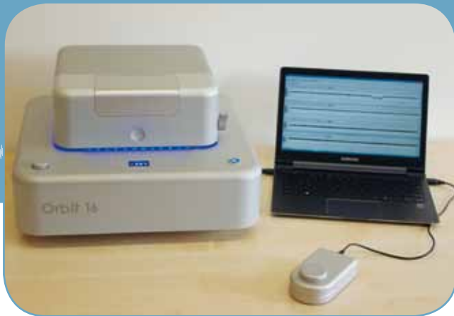
Orbit mini with big brother Orbit 16.