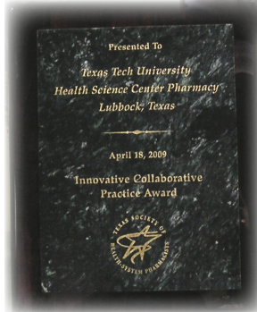
A close-up of the 2009 TSHP Innovative Collaborative Practice Award, which was presented to the TTUHSC Pharmacy in Lubbock in recognition of the TTUHSC Telepharmacy program.