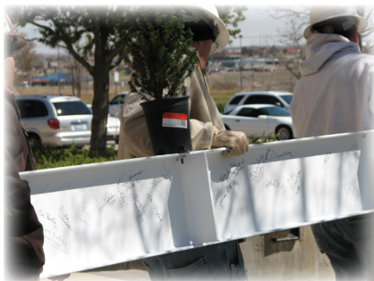
Construction workers prepare to hoist the signed ceremonial beam at the April 6 Topping Out Ceremony for the SOP's academic classroom building.