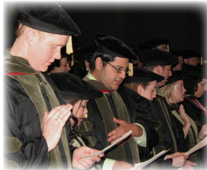
The SOP Class of 2009 recites the Oath of a Pharmacist at the annual Hooding Ceremony.

With that in mind, I'd like to thank the many people who