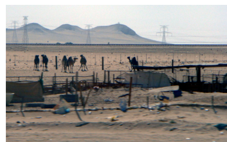
Some of the "free-range" camels that can be seen roaming the desert landscape in Saudi Arabia.

We also learned a lot about Saudi culture. Women cannot go out in public without a male member of their family or spouse and there are no groups of women or single women allowed outside the home. The country has a very high smoking rate, which contributes to a high incidence of cancer death. Camels (the four-legged type, not the cigarettes) run free in the desert and everyone drives at top speeds through city streets, so traveling by car is done at your own risk. Gas, as you might expect, is very cheap!!!