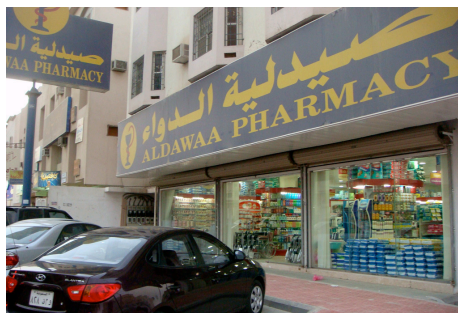
Outside one of the chain drugstores in Saudi Arabia.

The Community pharmacy, however, was much different. All