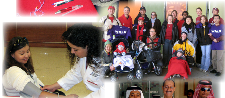
A photo of the Dallas/Fort Worth SOP team that participated in the 2008 Memory Walk at the Dallas Zoo.