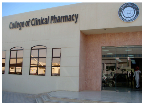
A view of the front entrance at Saudi Arabia's College of Clinical Pharmacy.

Saudi Arabia is in the midst of instituting a Western-style accrediting process for its universities and major professional schools. The College of Clinical Pharmacy is new and is the only one of 22 pharmacy programs in Saudi Arabia that offers the Pharm.D. degree. The College is in year five of the six-year post-high school program.