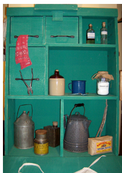
A view of the TPM's Chuck Wagon exhibit

To coincide with Texas Archeology Awareness Month, The Panhandle-Plains Historical Museum in Canyon held its first Archeology Fair on Oct. 28 and the Texas Pharmacy Museum was among the contingent of volunteers who provided information and demonstrations at the event.