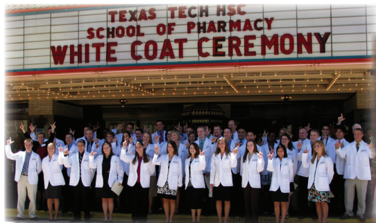
The Abilene Class of 2012 flashes the “Guns Up” sign outside the Paramount Theatre at the Aug. 3 White Coat Ceremony.

This year’s events were sponsored by CVS/Caremark.