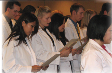
Members of the Amarillo SOP Class of 2012 recite the Oath of a Pharmacist for the first time at the Aug. 10 White Coat Ceremony.