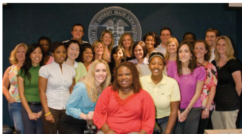
The 2008 SOP residents pose for a group photo at the Dallas/Fort Worth Residency Workshop.