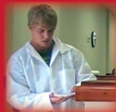
A Raider Red camper at work in the SOP Abilene campus lab.