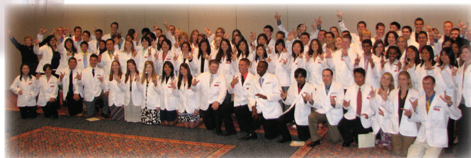
It's a “Guns Up” day for the Amarillo SOP Class of 2012 following the Aug. 10 White Coat Ceremony.