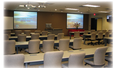
A partial view of the state-of-the-art classroom at our new D/FW addition.

The Dallas VA Medical Center is also a critical partner for our Metroplex programs and we will continue to maintain our campus at Dallas VAMC.