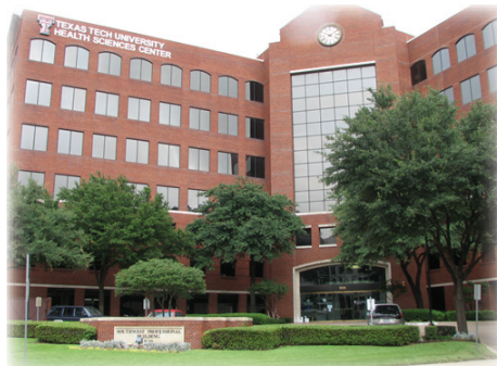
The site of the new TTUHSC-SOP facilities for the Dallas/Fort Worth regional campus.

The 9,300 square-foot space provides us with the capacity to host more students in the Metro-