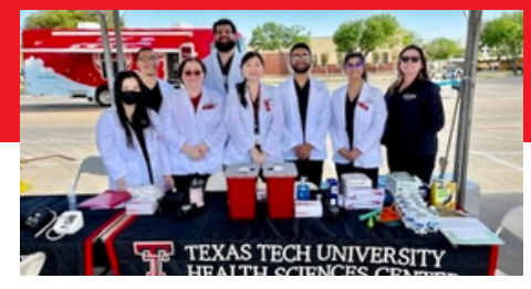
Dallas APhA and Stuco students had a booth at the Carrollton Health and Safety Fair where students provided blood pressure and blood sugar screenings to more than 80 patients.