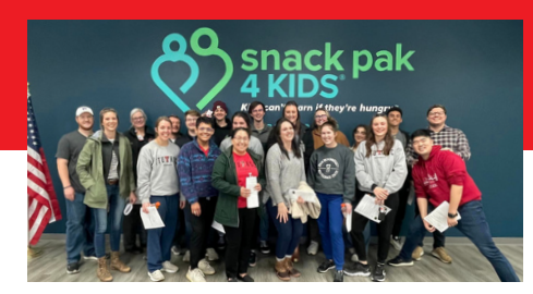
Amarillo Student Council members volunteered at Snack Pak 4 Kids Amarillo and helped pack 2,695 snack paks for children facing situational food insecurity.