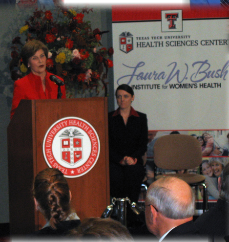
First Lady Laura Bush discusses the mission of the Laura W. Bush Institute for Women's Health, formerly known as the Women's Health Research Institute.