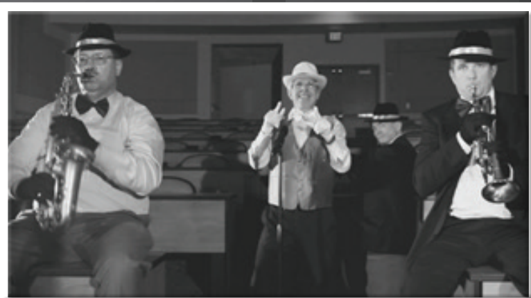
Various deans of TTUHSC jazzd up for the Speakeasy Soiree

The Children's Advocacy Center of the South Plains (CACSP) brings together community resources to speed the healing of child victims of abuse and trauma. CACSP improves the lives of abused children and coordinates the investigation and prosecution of severe child abuse cases in Lubbock County and 14 other South Plains counties.