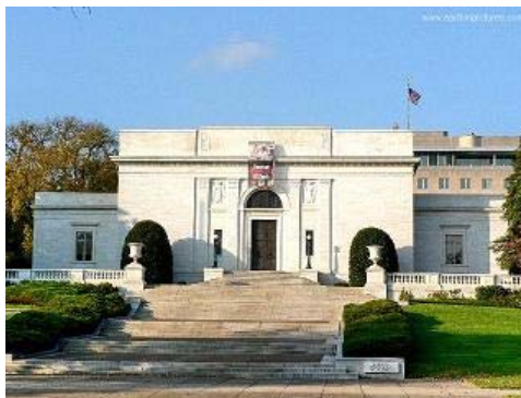
The APhA Headquarters building located on the National Mall in Washington, DC.

We need your help in raising money for the Texas Tech brick. Our chapter has decided to match dollar for dollar each of the donations pledged by students and alumni (up to $500). Any donations that we receive beyond $500 will go towards the purchase of further bricks in the name of our chapter. Please help us ensure that the Texas Tech School of Pharmacy's name is included in this important piece of pharmacy history. Please log on to www.homeofpharmacy.org to see the projected appearance of the building and to donate to the Texas Tech fundraising effort. Any dollar amount you might choose to give can be donated online. We appreciate your efforts and loyalty to our organization.