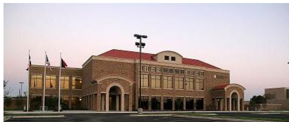
Texas Tech University HSC School of Pharmacy Abilene Campus.

Amarillo is also expanding with a 24,000 square foot. new Pharmacy Academic Building that will be located immediately in front of the current Pharmacy Building. This building, anticipated to be open in August 2009, will have two new classrooms seating 120 students that will replace our main teaching classrooms in the existing pharmacy building, a student services suite, consolidating all student services personnel, and a Clinical Simulation and Assessment Center – a facility with patient exam rooms, debriefing conference rooms that can