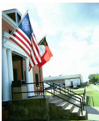
The current Texas Tech HSC SOP Dallas building on the VA campus.

The next two buildings are on the Amarillo campus. First, a new 48,000 square foot research building is currently under construction to house our growing basic research program. It will be shared with Medicine’s scientists, with Pharmacy