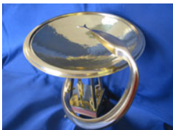
Alumni Best Practice Award recipients will receive a Bowl of Hygieia sculpture.