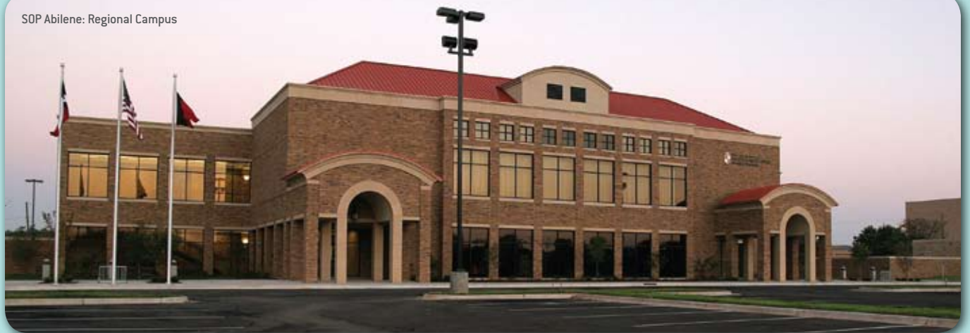
SOP Abilene: Regional Campus