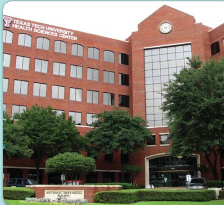
SOP Dallas: Southwest Campus

Today there are 92 P3 and P4 students, 16 faculty, 13 residents and four staff members at the SOP's D/FW regional campus sites.