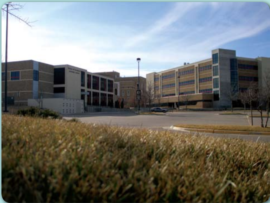
SOP Main Campus: Amarillo

Students who enroll in TTUHSC's pharmacy program have the option of attending their first and second years of classes at the main campus in Amarillo or at the SOP's Abilene regional campus. Students at the Amarillo campus can remain there for their third and fourth years or they can transfer to either of the SOP's regional campuses in Lubbock or Dallas/Fort Worth. Abilene students remain at that campus for all four years.