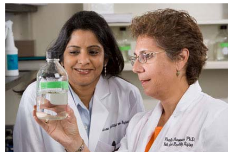
The Grammas Lab TTUHSC Stock Photo

other race/ethnicities along the Texas-Mexico Border region in the future.