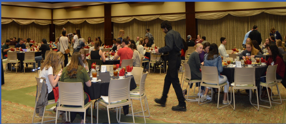
Jan. 16th—GSBS Open House 2019 was the largest ever attended! Don't forget to request your application fee WAIVER if you attended!

Looking for what is next in your career? Whether you are looking to expand your research experience, preparing for Medical School, or anything along the Biomedical Sciences concentration, the GSBS can be the stepping stone to your success!