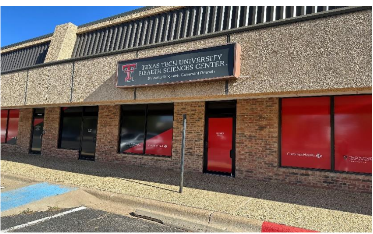
Covenant Office of Medical Education 3706 A 20th Street

Covenant Health System encompasses six locations with more than 1,000 licensed beds, including Lubbock's only Children's Hospital with a fully dedicated Children's Emergency Department. Covenant Branch students will have a truly hands-on one-on-one experience with Covenant Health System physicians as well as private practitioners. Students will also have clinical experiences on the Lubbock TTUHSC campus with Texas Tech Physicians and University Medical Center. We offer a robust experience in surgery,