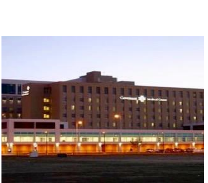
Covenant Medical Center, 3615 19th Street

Texas Tech University Health Sciences Center School of Medicine Covenant Branch, a joint venture between TTUHSC School of Medicine, Covenant Health System and Covenant Medical Group, is an alternate training site for students staying in the Lubbock area, but wishing to experience community-based medicine. Since its establishment, we have expanded to include additional hospitals, Grace Medical Center, Children's Hospital, Covenant rural experiences, Yoakum County Hospital (Denver City), WJ Mangold Memorial Hospital (Lockney). The Covenant Branch Office of Medical Education is located adjacent to Covenant Medical Center on 20th and Louisville Ave. Our office is a spacious 7900 sq ft facility with 10 individual study rooms and 5 larger didactics rooms and a classroom. Each student on the Covenant Branch campus have 24 hours access to the office.