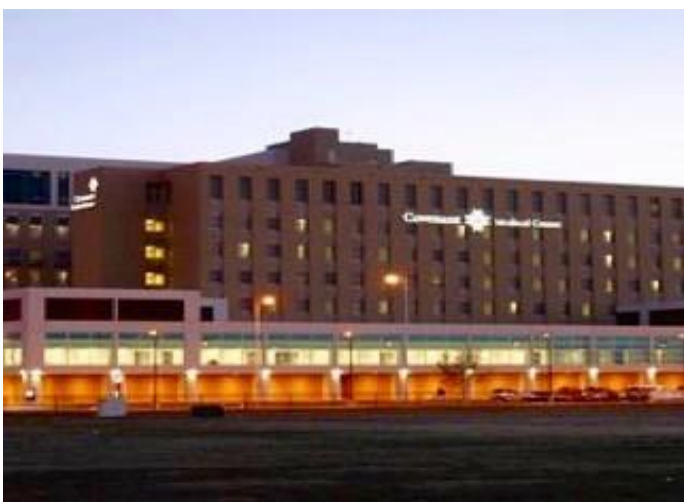
Covenant Medical Center, 3615 19th Street

Covenant Health System encompasses six locations with more than 1,000 licensed beds, including Lubbock's only Children's Hospital with a fully dedicated Children's Emergency Department. Covenant Branch students will have a truly hands-on one-on-one experience with Covenant Health System physicians as well as private practitioners. Students will also have clinical experiences on the Lubbock TTUHSC campus with Texas Tech Physicians and University Medical Center. We offer a robust experience in surgery,