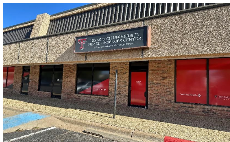
Covenant Office of Medical Education 3706 A 20th Street