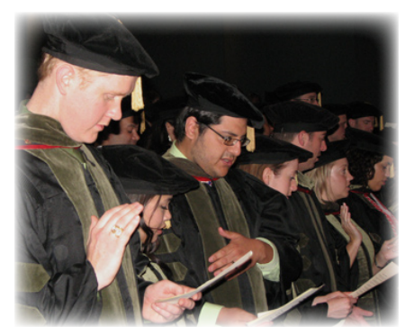
The SOP Class of 2009 recites the Oath of a Pharmacist at the annual Hooding Ceremony.

helped make the 2009 hooding ceremony and graduation such a successful event for our students and their families. I'd also like to express my gratitude to all the faculty and staff who traveled to Lubbock to support our graduates.