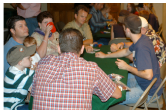
The TTUHSC - SOP Ten Year Reunion Round-up was a shindig for friends, families and some little buckaroos. SOP card players also got a chance to display their skills.

The celebration concluded the next day at the Globe-News Center for the Performing Arts in Amarillo with a reception and live music by the Amarillo College Faculty String Ensemble and the Martinis jazz band. It was truly a fantastic weekend and I'd like to express my gratitude to all those who helped put this celebration together. I also want to offer a very special "thank you" to the Amarillo Globe-News and CVS/pharmacy for sponsoring the festivities.