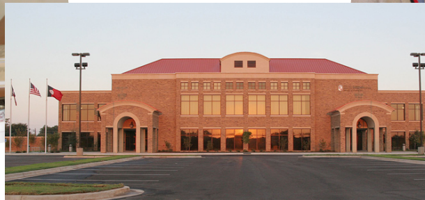
Daybreak at the new SOP regional campus building in Abilene.