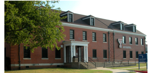
The SOP's Dallas/Ft. Worth regional campus.

Other institutions who are part of the NCTCTSI include Texas A&M Health Science Center's Baylor College of Dentistry, UT-Austin School of Nursing, University of North Texas Health Science Center in Fort Worth, UT-Dallas School of Behavioral and Brain Sciences, the Dallas campus of the UT Health Science Center at Houston School of Public Health and the Erik Jonsson School of Engineering and Computer Science at UT-Dallas.