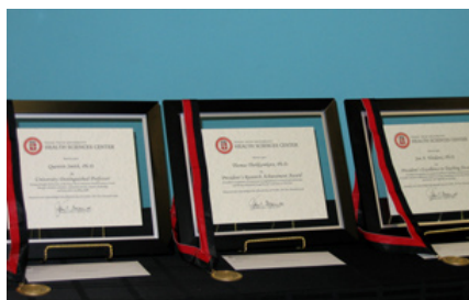
SOP faculty received three TTUHSC President's Awards in 2007.