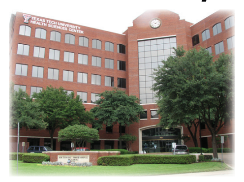
The site of the new TTUHSC-SOP facilities for the Dallas/Fort Worth regional campus.

The 9,300 square-foot space provides us with the capacity to host more students in the Metro-