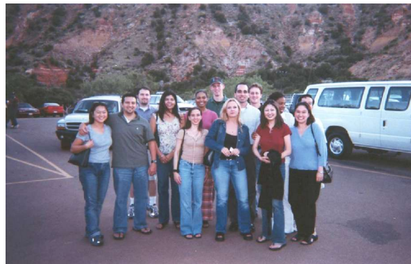
Residents who attended a three-day July workshop in Amarillo take time out to visit Palo Duro Canyon for a showing of "Texas Legacies."

The new resident class started July 1. That same month the group came to Amarillo for a three-day Resident orientation and workshop where they spent time getting to know each other and hear about each other's campus environment. They also learned about Texas Tech School of Pharmacy (most of the new residents attended other Pharm.D. program) and acclimated themselves to the idea of being new faculty members rather than students. (All residents serve as Assistant Instructors for the School of Pharmacy and provide significant clinical instruction for all our campuses.)