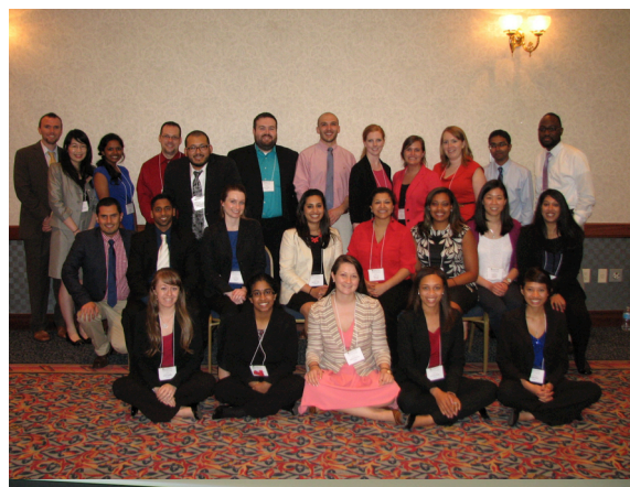
Residents interact and present with other TTUHSC SOP affiliated residents