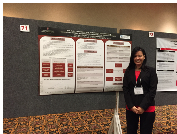
Residents present posters at ASHP Mid-Year Clinical Meeting and TTUHSC SOP Research Days