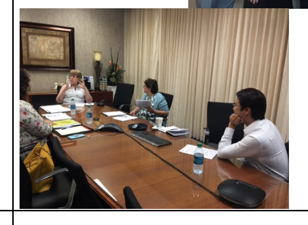
Integrity for the exceptional hospitality!