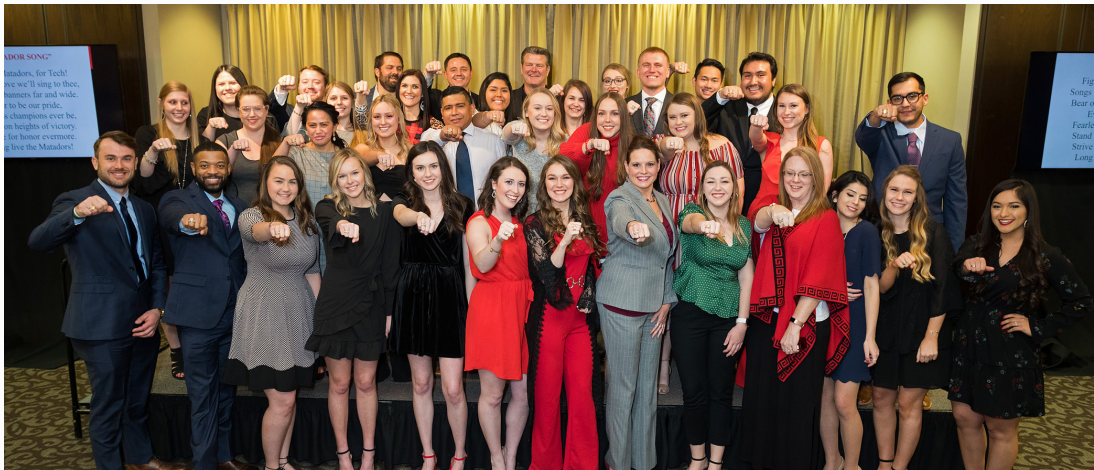
Students at the TTUHSC Official Ring Ceremony | February 16, 2019