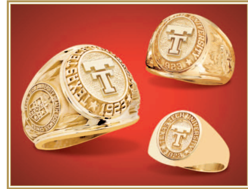
Men's and women's traditional rings pictured above. Women's signet ring pictured in lower right.

Available exclusively to students who have achieved senior year standing.