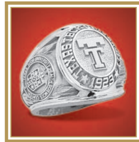
Men's 14 kt. solid white gold pictured in approximate actual size. All ring styles are available in white gold.